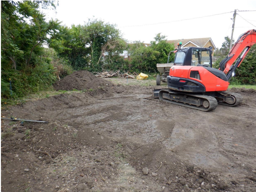
Plate 3. Stripping topsoil in parking areas and turning area (looking North)