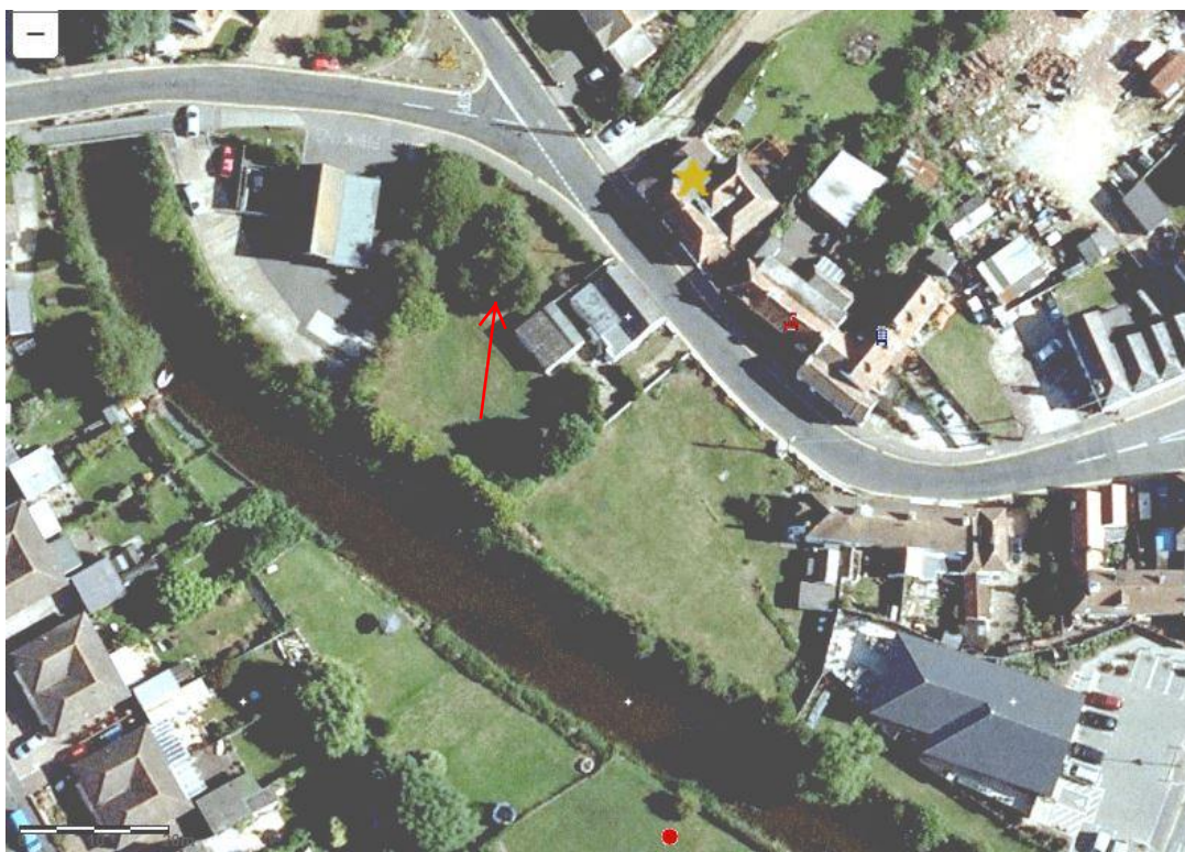
AP 1. . Proposed development area watched (Red arrow)