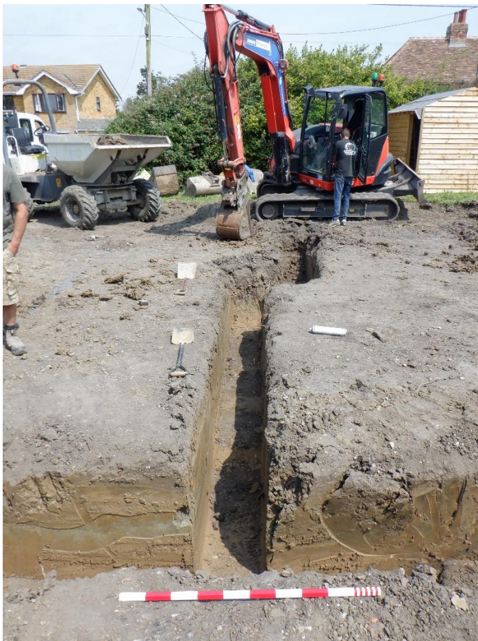
Plate 4. Trenching subsoil for car spaces (looking NNE)