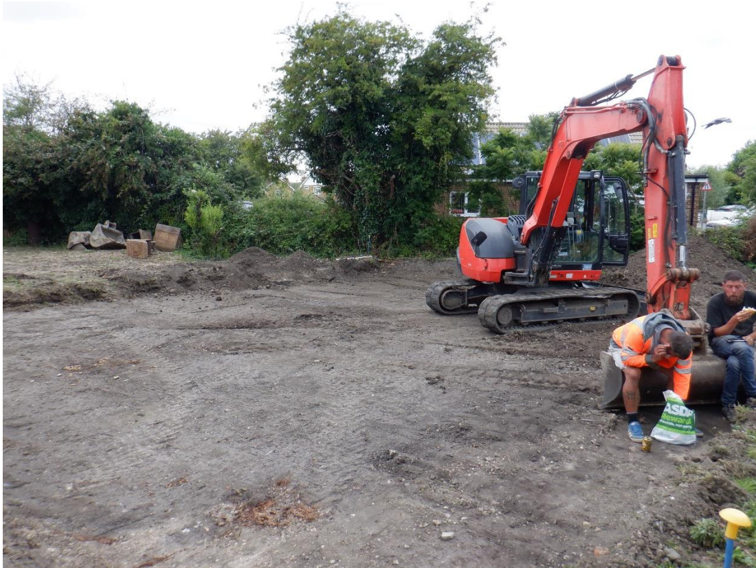
Plate 1. Removing topsoil (looking NNW)