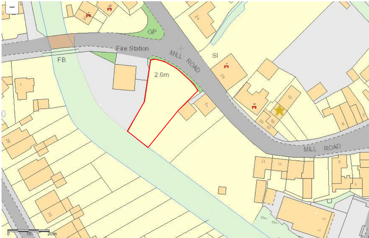
Figure 1. KCCHER map of site location at NGR 609965 129233 (Red line)