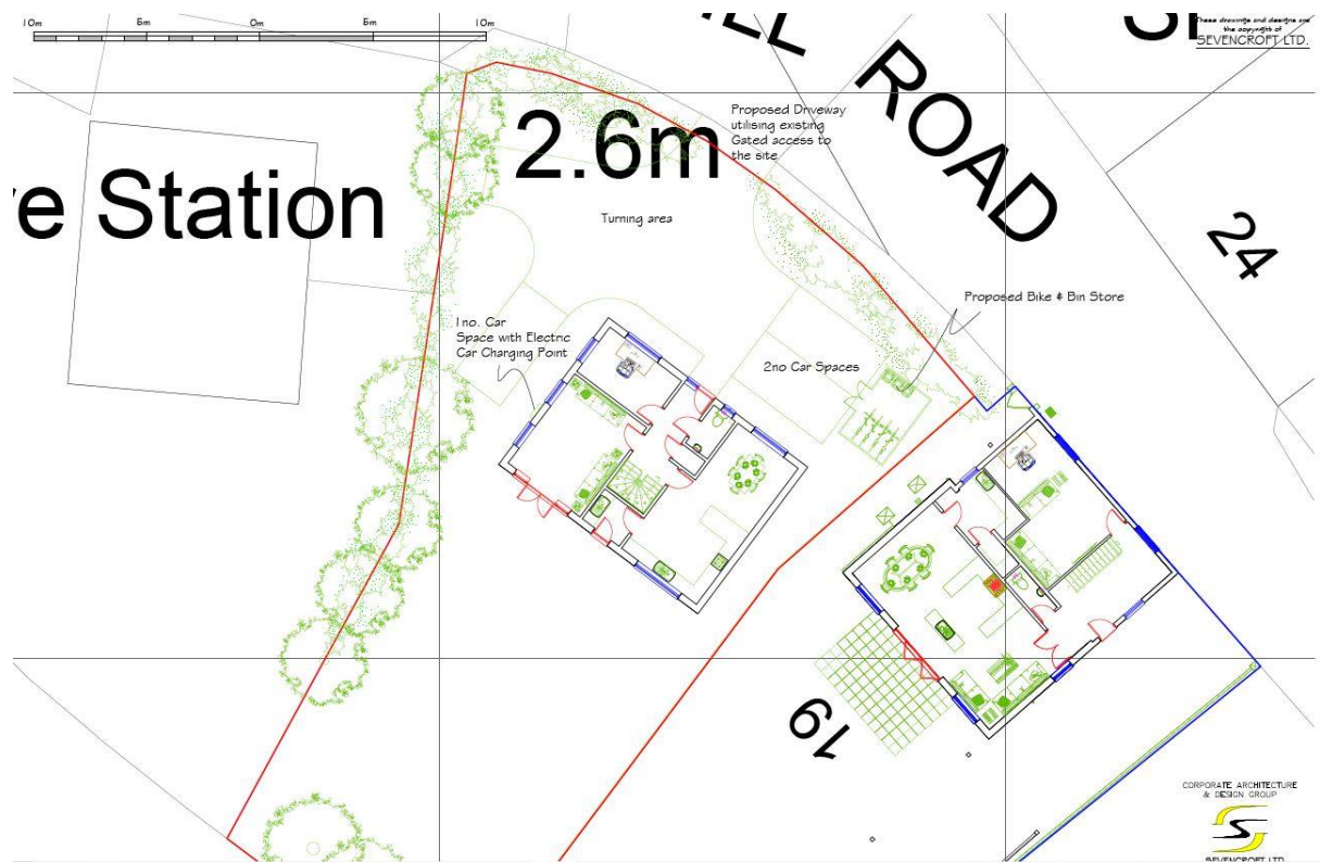
Figure 2. Proposed development (red line)