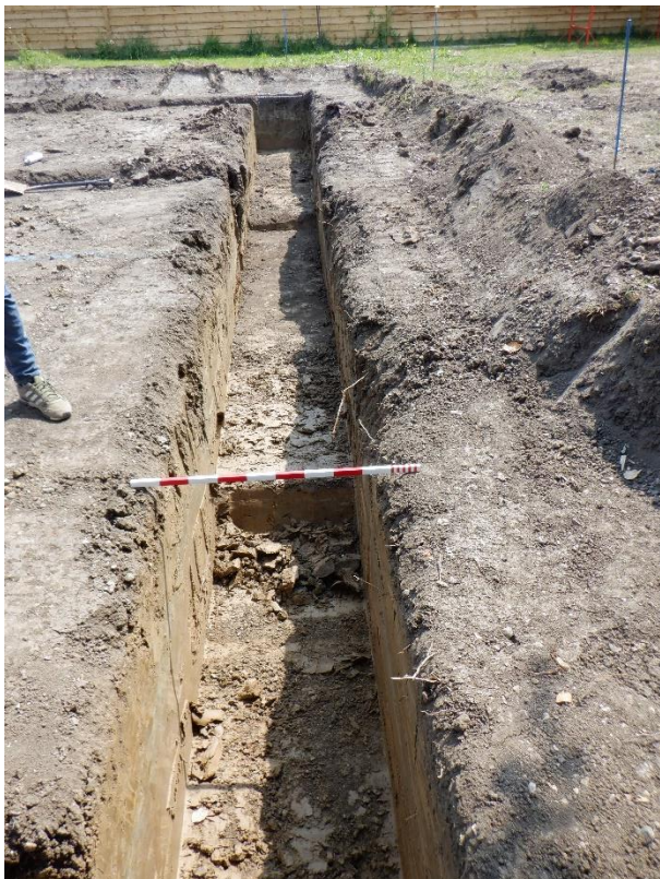
Plate 6. Foundation trenches (looking East)