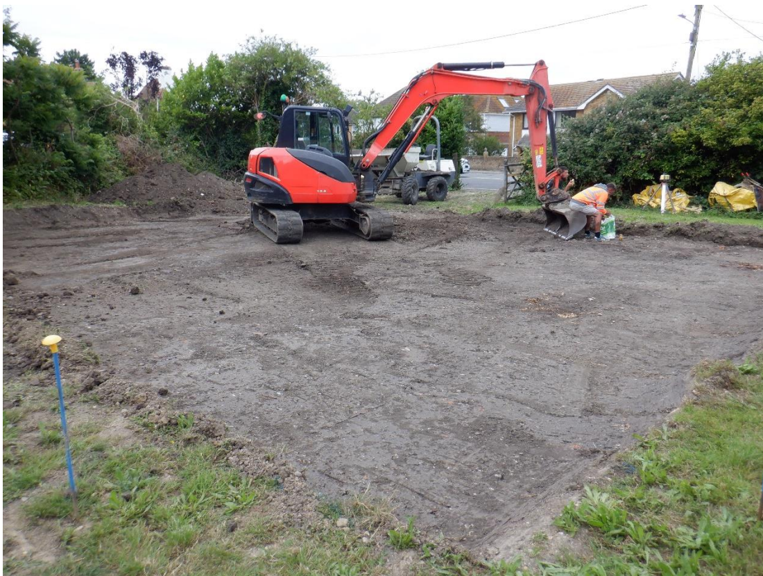
Plate 2. Trenching subsoil (looking SW)