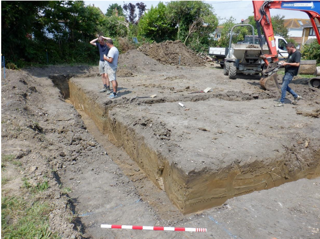
Plate 5. Checking depths of foundation trenches (looking NW)